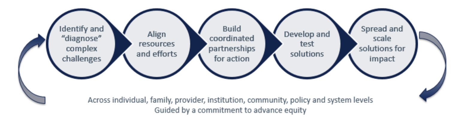
Figure 1. The Louisiana Department of Health - Operational Strategy

As indicated in Figure 1, a first step is to identify and diagnose complex challenges. Figure 2 maps out the key drivers that contribute to the goal of eliminating racial disparities in maternal and child health outcomes for African American infants and mothers. Primary drivers identified are: organizational understanding and readiness, data collection and reporting, communication and outreach, policy and systems shifts, access to health coverage and quality care, and community engagement.